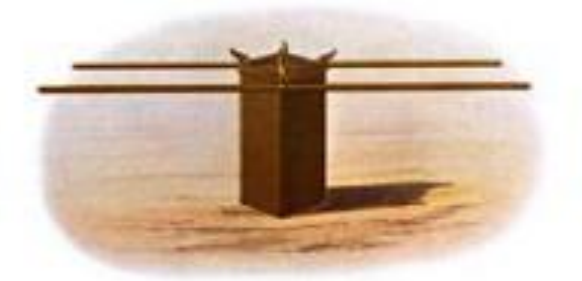
Gold Altar of Incense Ex. 37:25-28