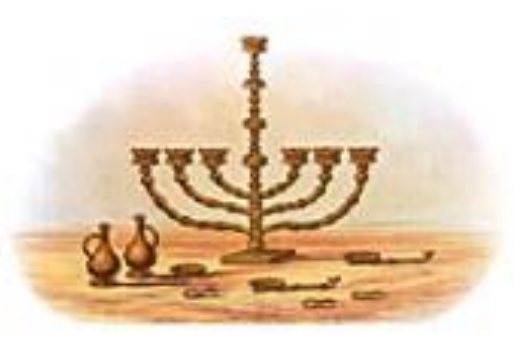
Golden Lampstand Ex. 25:31-40; 37:17-24