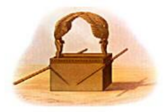
Ark and the Mercy Seat Ex. 25:10-22; 37:1-9