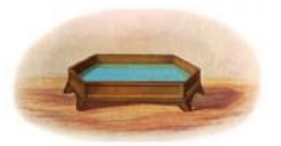
Bronze Laver Ex. 38:8